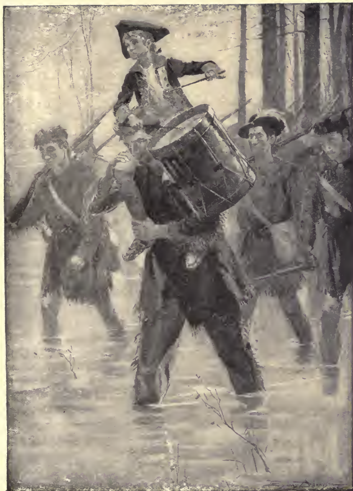
“ BEATING THE CHARGE WITH ALL MY MIGHT.”